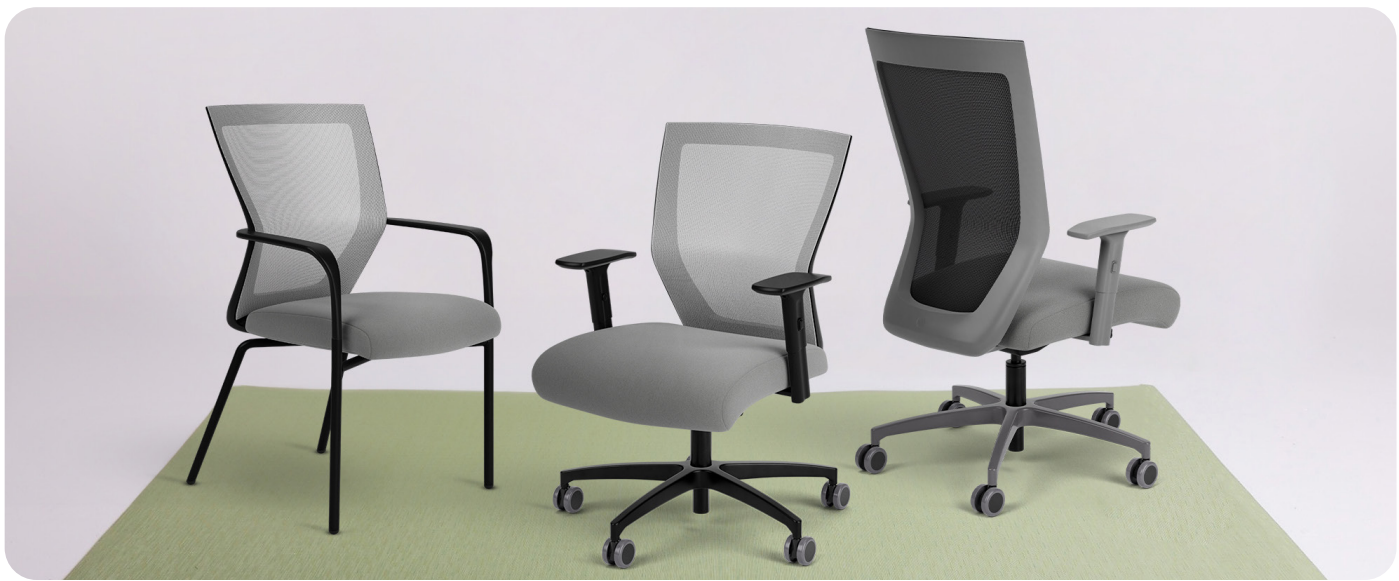
Guest chair #931