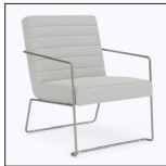
Parallel stitch soft seating chair #938