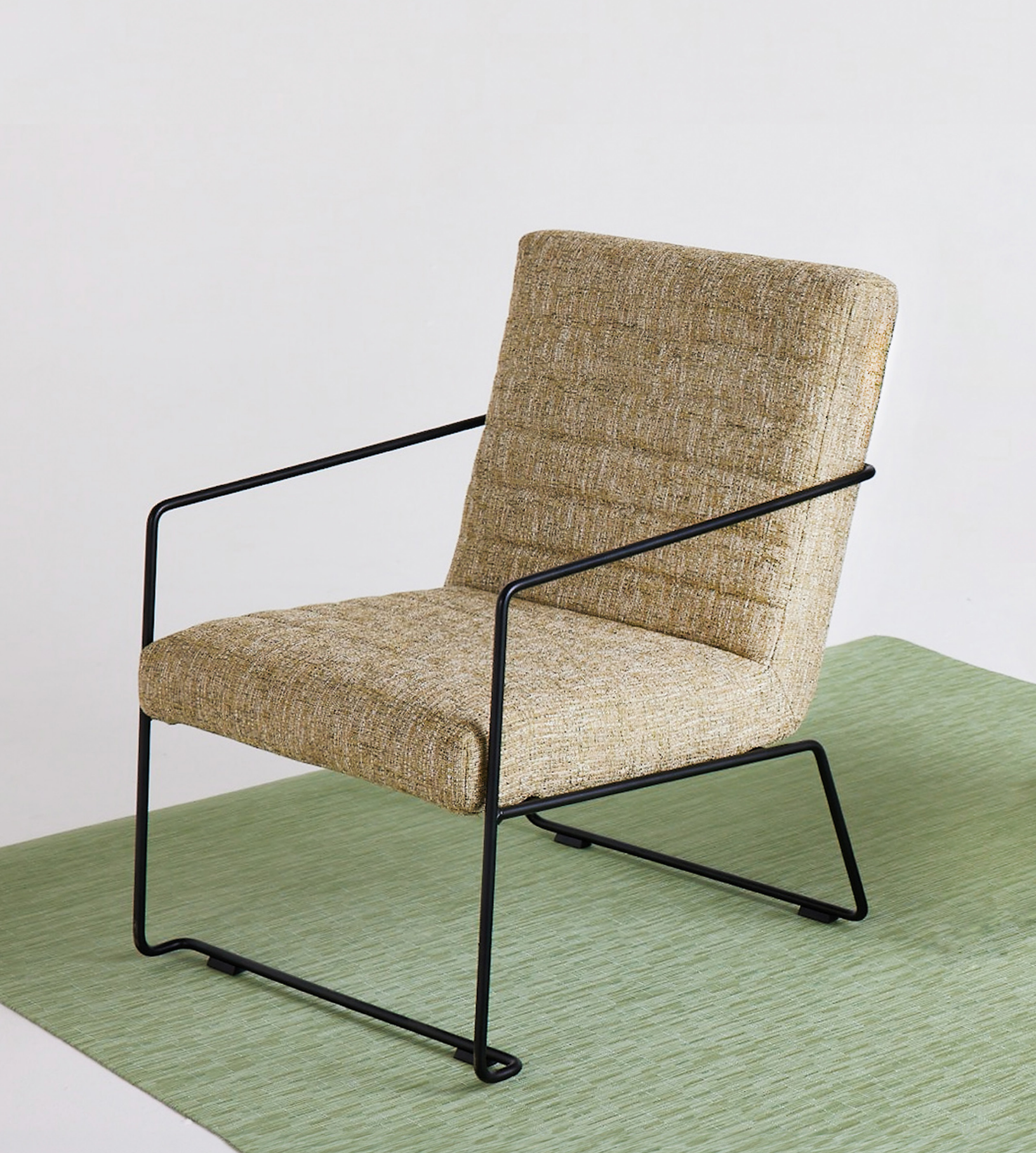
Muir design by Studio V