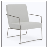
Seamless soft seating chair #937