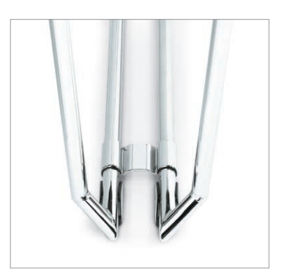
Chairs can be ganged together using ganging clamp set