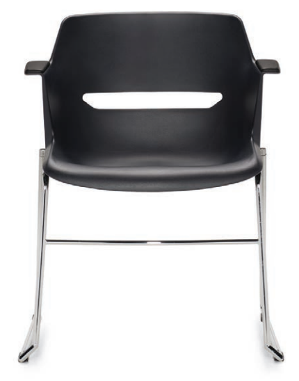
Seating shown in Night shell with Black SSU armcaps and Chrome frame