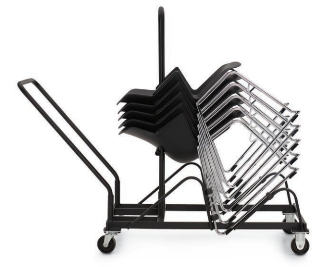
Plastic sled base chairs stack 5 high on the floor and 14 on the dolly Upholstered sled base chairs stack 4 high on the floor and 8 on the dolly