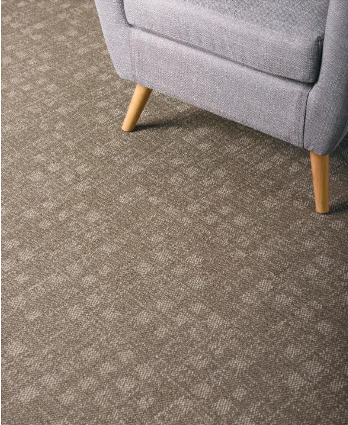
(page 4) Oxford Duck , monolithic and Classics Heirloom , LVT. (above) Oxford Muslin , quarter turn. (page 5 & 6) Madras Duck , monolithic.