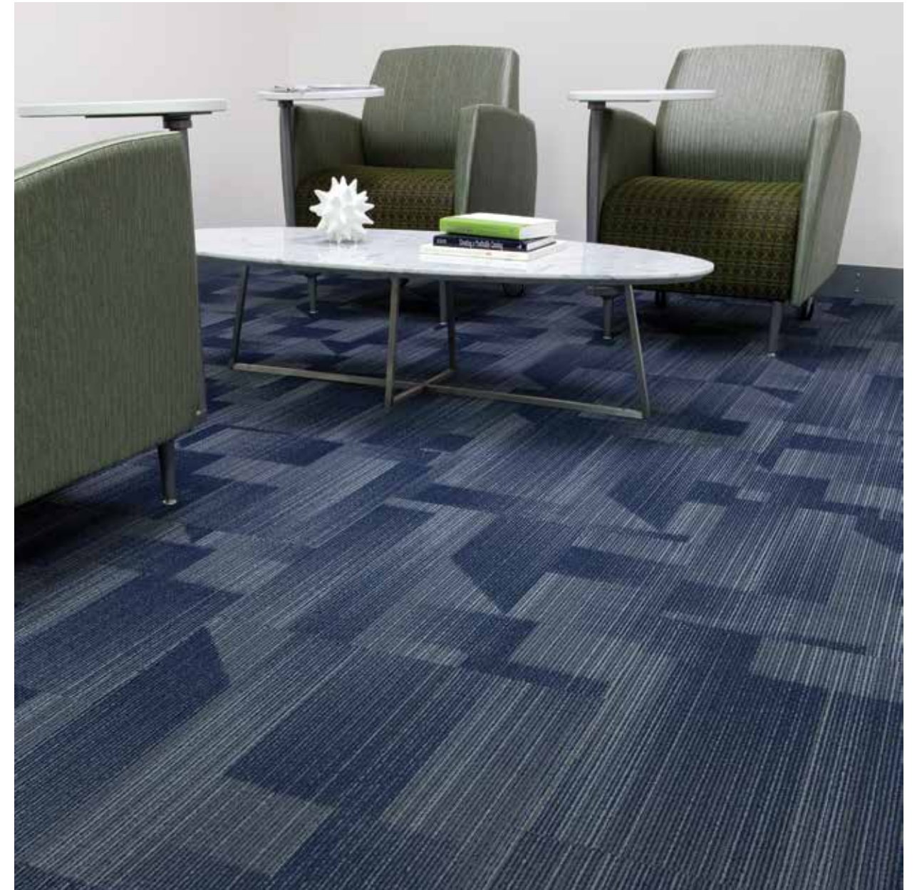
(above) Skyline Vanishing Point , ashlar. (left) Skyline Zenith , non-directional.