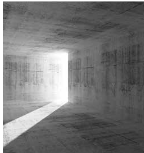
(top) Skyline Overlook , non-directional with Index Volume . (right) Elevated Overlook and Vista , monolithic.