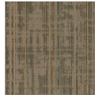
style 7059 2224 lightspeed