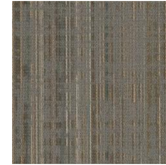
style 7059 2219 expansion