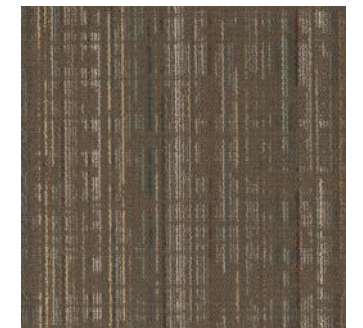
style 7059 2226 interval