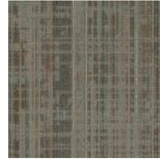
style 7059 2218 connection