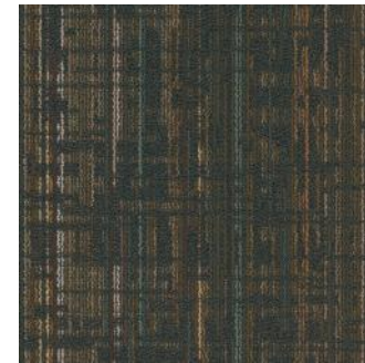
style 7059 2221 magnetic