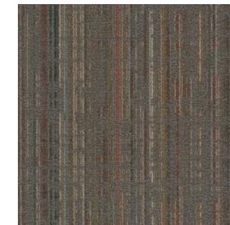
style 7059 2228 free fall