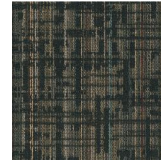
style 7059 2222 cosmos