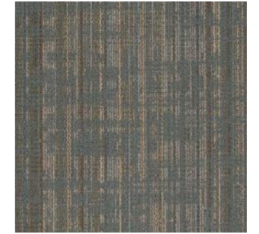
style 7059 2220 zoom