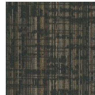
style 7059 2227 gravity