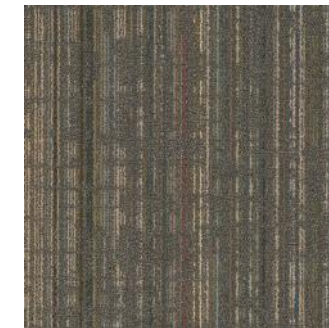
style 7059 2225 in motion