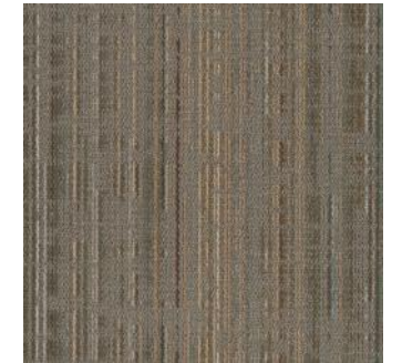
style 7059 2223 uniformity