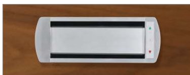
Power block in table top, closed.