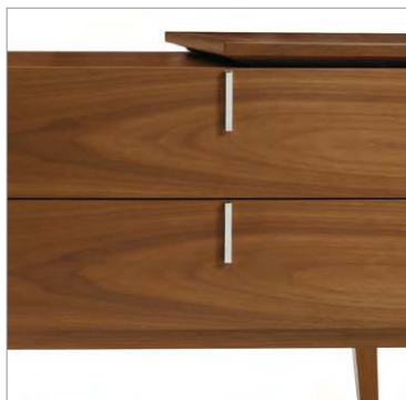
Peninsula table connects to a pedestal.