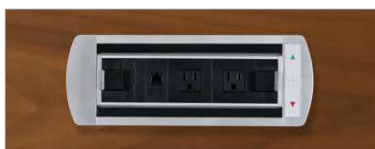
Power block in table top, open.