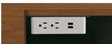
Undermount power block available in White or Black.