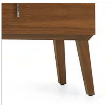
High leg on credenzas, pedestals and freestanding storage.