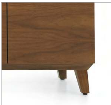
Low leg on credenzas, pedestals and freestanding storage.