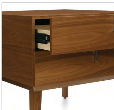
Drawers with wood interior.