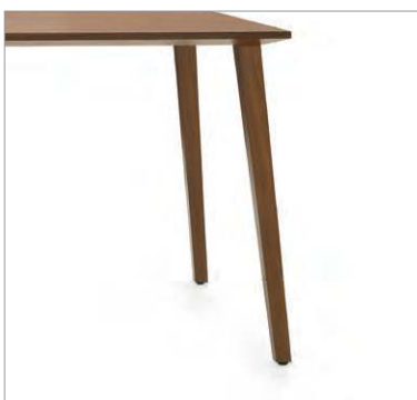
Tables available in standard or counter height.