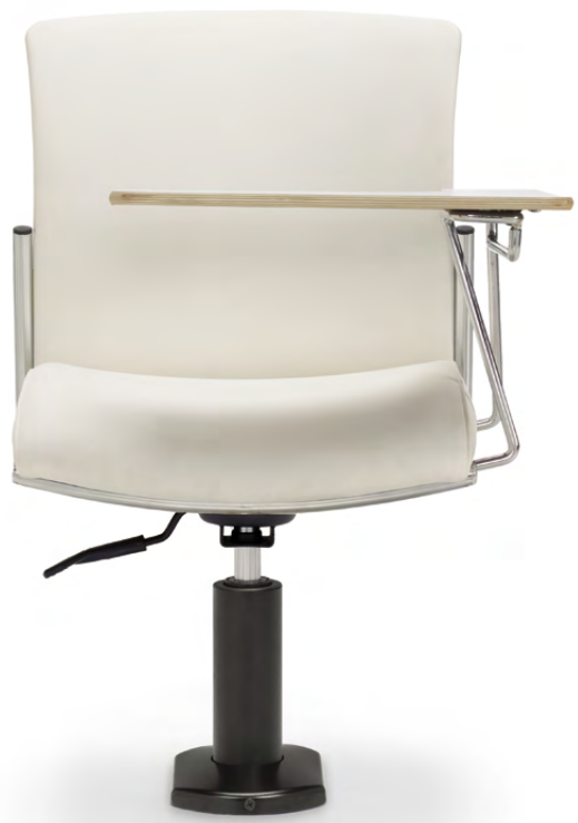
Vion with upholstered seat and back, left hand tablet arm

Duet, Vion and Sonic pedestal seating series include models with both right and left handed tablets. These models offer a convenient surface for taking notes and filling out forms in learning spaces or government offices where customers may need to complete forms or documents on location. Tablet arms are hinged and flip-up to provide easy access.