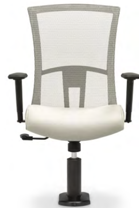
Vion pedestal seating