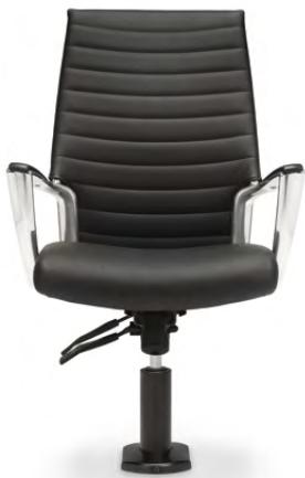
Global Accord pedestal seating