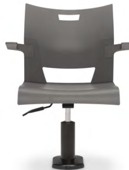
Duet pedestal seating