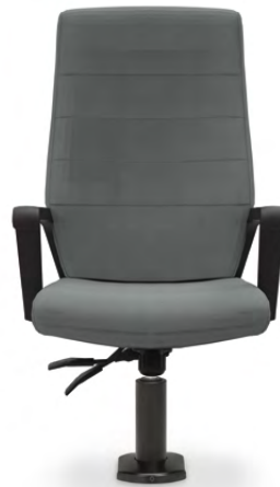
Luray pedestal seating