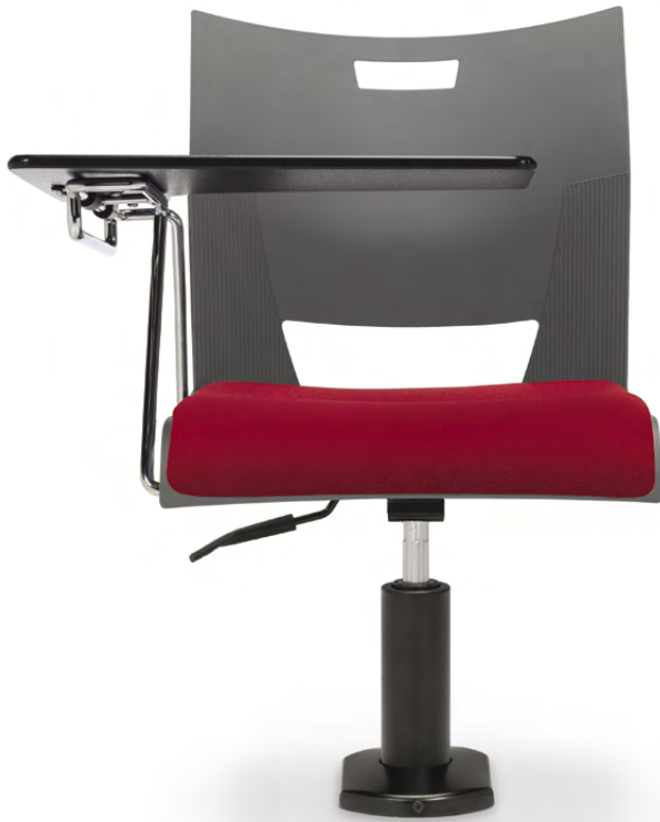
Duet with upholstered seat, right hand tablet arm