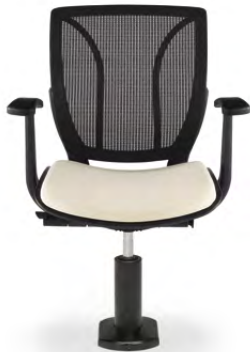
Roma pedestal seating