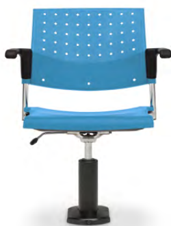
Sonic pedestal seating