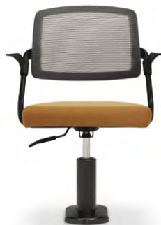
Spritz pedestal seating