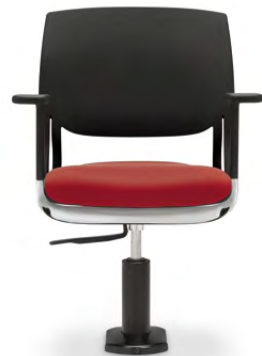
Novello pedestal seating

Global offers a range of seating series with features designed for function, durability, comfort and style to meet the needs of many applications. All pedestal bases feature 2" pneumatic height adjustment with a cylinder return to maximum height. Choose from swivel, self-centering swivel and non-swivel options. Additional features are specific to each seating series.