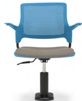
Stream pedestal seating