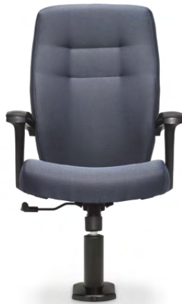
Synopsis pedestal seating