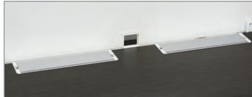
Optional power access door (split width)