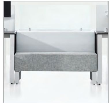
Integrated soft seating