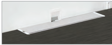
Optional power access door (full width)