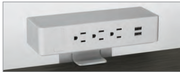
Optional worksurface edge-mounted power