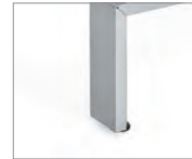
Standard leg on storage and seating