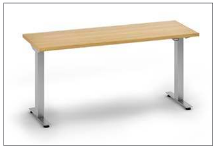
Type B: available in electric, 2-leg setups, three finishes. Made in USA.