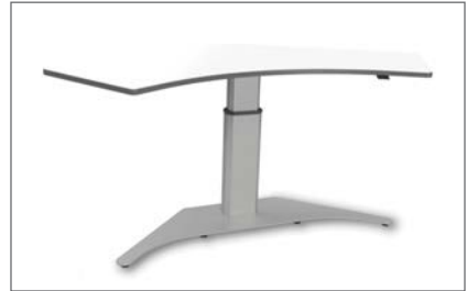
Type D wing-base: available in pneumatic, 3 finishes.