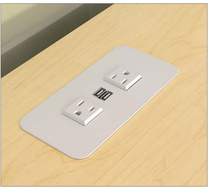
Power, data, and video connections can be brought to the worksurface using pass-through grommets or desk-mounted electrical grommets.