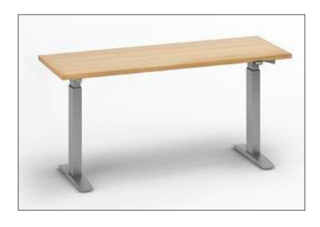
Type A: available in electric or pneumatic, 2- or 3-leg setups, 12 finishes, Made in USA.