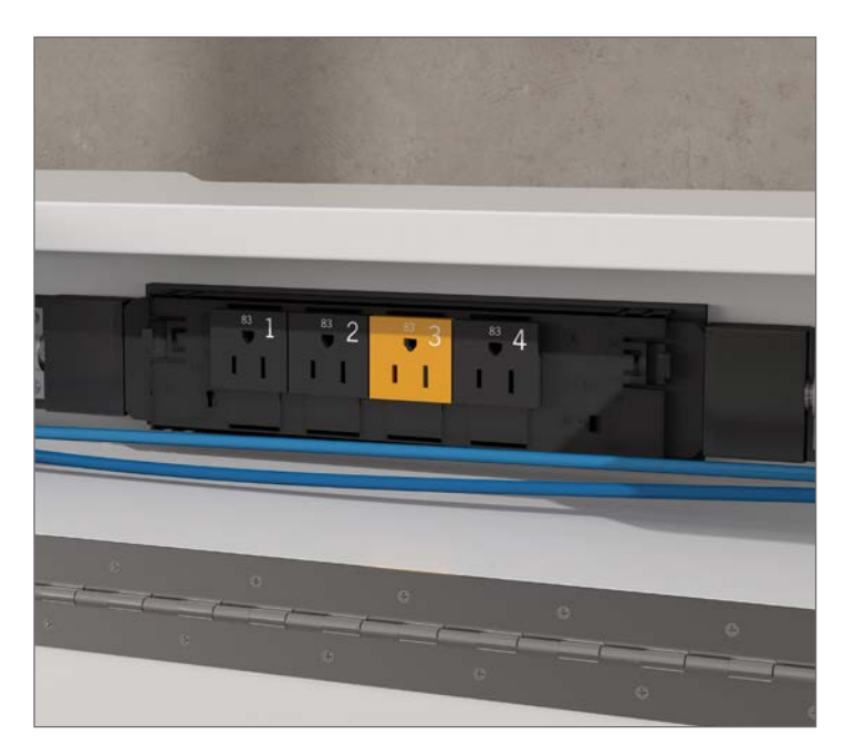
Hover offers an 8-wire/4-circuit system that is UL-listed. One circuit can be centrally controlled in accordance with CA Title 24 and other local regulations.