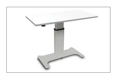
Type C H-Base: available in pneumatic, 3 finishes.