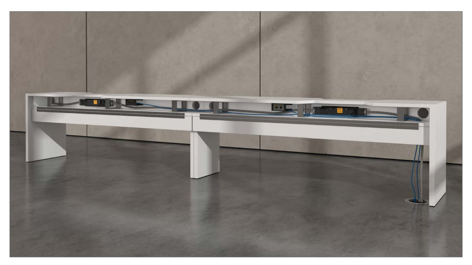
Power and data cables are neatly tucked away inside the trough and are easily accessible via a piano-hinged door.